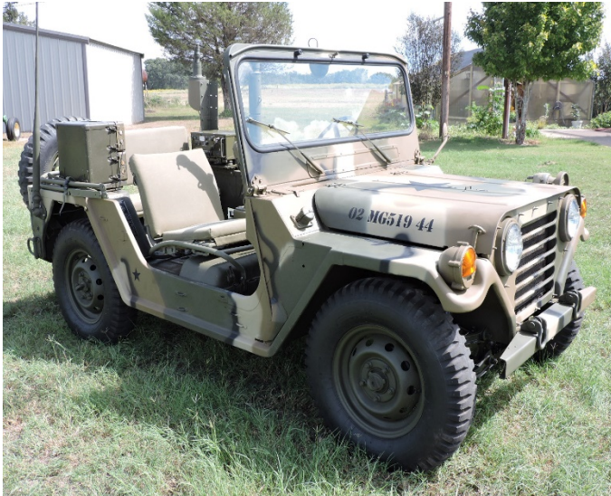
Mike G's M151A2 finished in late 2018.