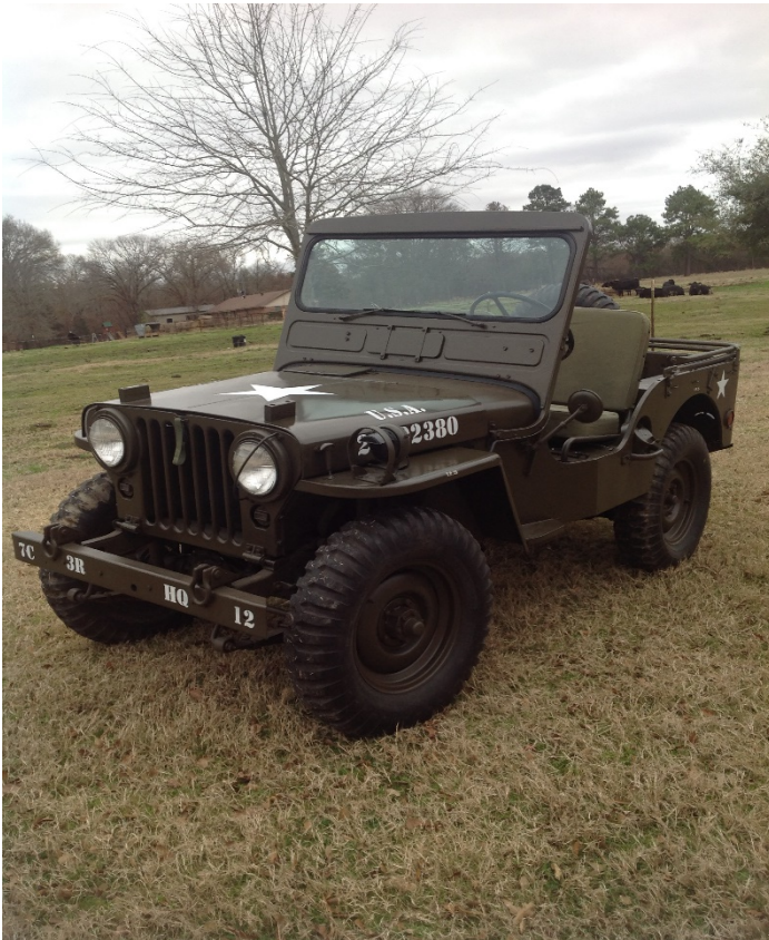
This is Rick Ellison's almost complete M38. Started last year and only needs a few minor items to complete. Looks good Rick!